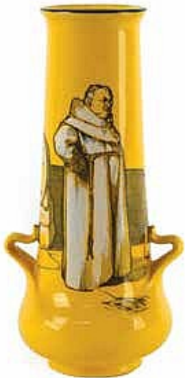
V28. Monk in cellar (height 160mm).