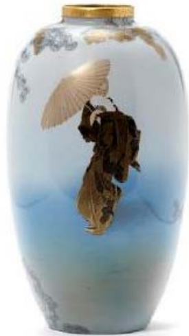
TV7. Geisha (height 26cm).