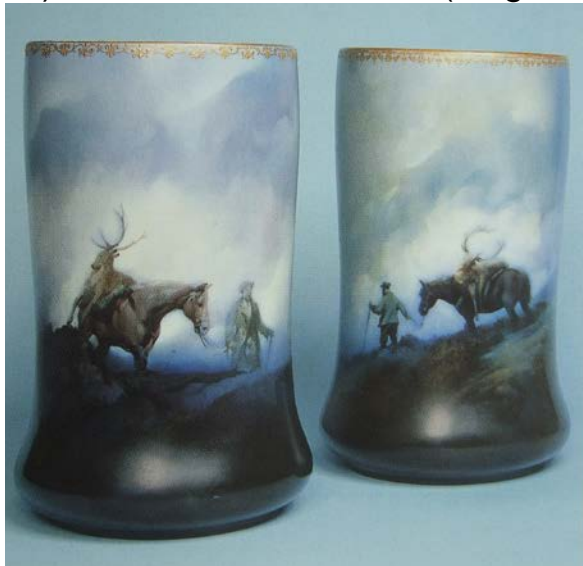
V20 Doulton swollen cylindrical vases with highland scene of a huntsman (ht 29cm).