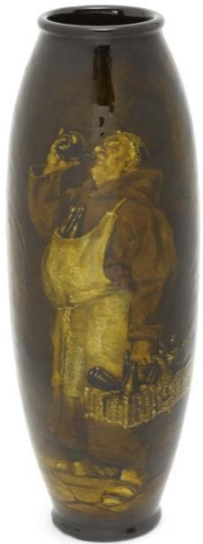
V24. Monk in the cellar (ht 265mm). Version 3.0