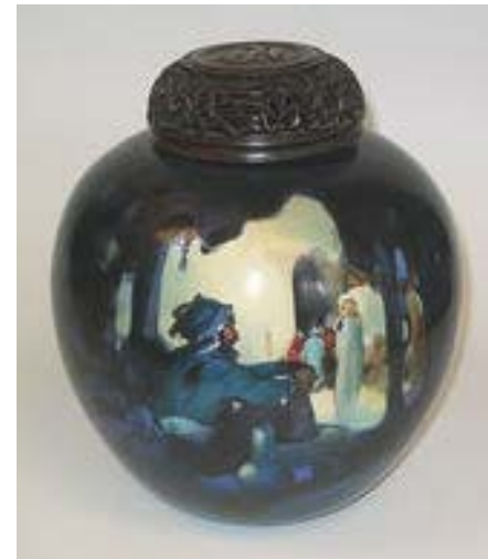
V9. Doulton Omar Khayyam vase – potter in market square (height 23.5cm)