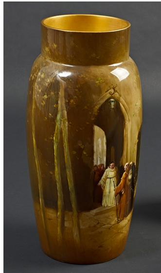
V25. The Monastery Door (ht 417mm).