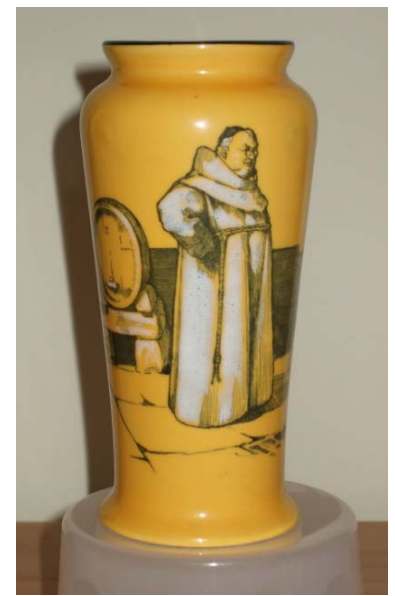
V8. Monk in cellar (height 145mm).