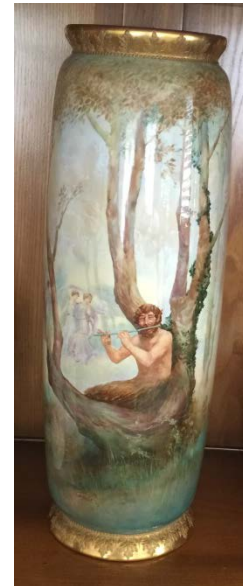
V31. Doulton vase (ht 450mm).