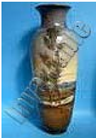
V12. Doulton. Rural scene (ht 425mm). 20 April 2015