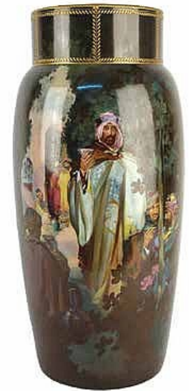
TV10 'Rubaiyat of Omar Khayyam', quatrain 37 (ht 440mm)