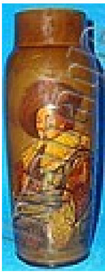
V10. Holbein vase. Cavalier (ht 24cm).