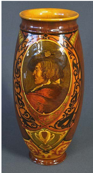
V26 Doulton Rembrandt vase (ht 30cm)