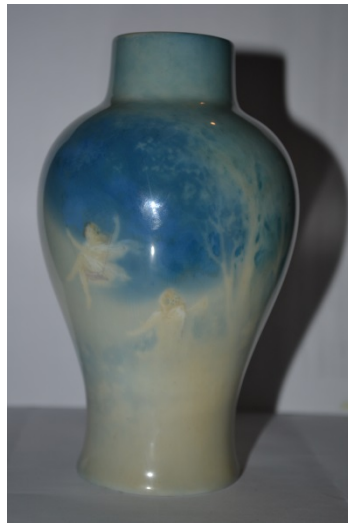
TV15 The Swing (ht 150mm)