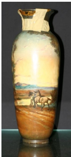
V11. Doulton. Ploughboy (ht 42cm) Version 3.0