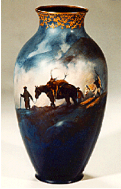
TV1. Highland scene (height 29cm).