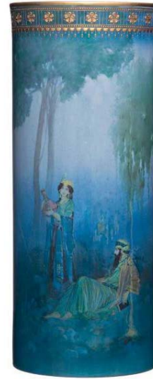
TV3. Omar Khayyam vase (height 30cm).