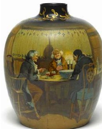
V13. Doulton. A Good Story (ht 285mm)