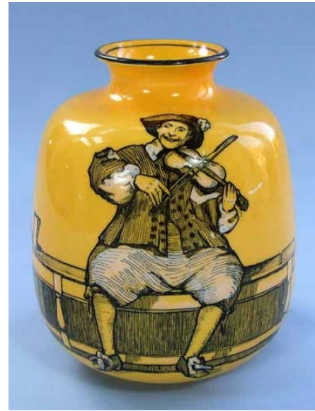
V6. Gentleman fiddler (height 100mm).