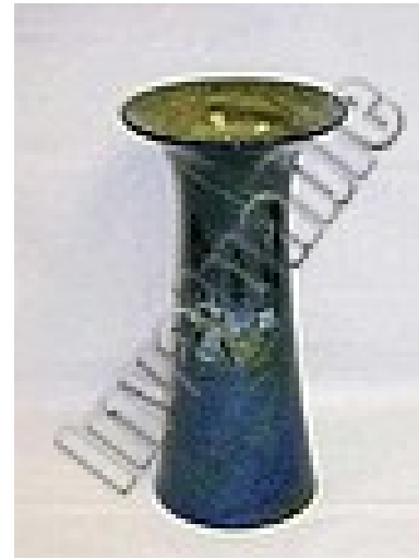
TV5. "Rock A Bye Baby" (height 13.5")