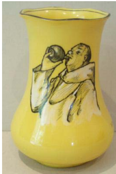
V5. Monk drinking from flask (height 120mm).