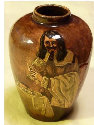
V29. (ht 13.5cm)