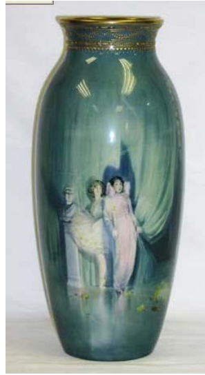
TV2. Girls scared by mouse (height 16.75")