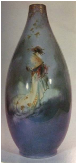
TV11 Japanese Lady (ht 350mm) Version 3.0