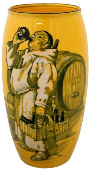
V4. Doulton Jolly Monk (height 180mm).