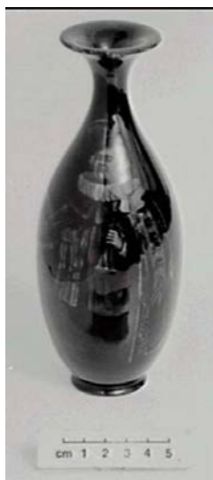
V2. Elizabethan man in hat holding cane & gloves.