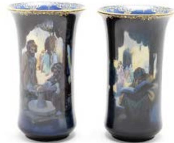
TV9. Pair of Omar Khayyam vases; potter at wheel, & reading a book (height 28cm).