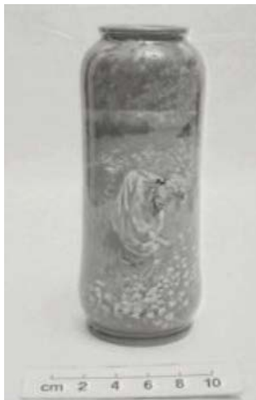
V1. Flower gatherer (height 204mm).