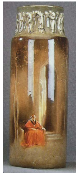
V3 Doulton cardinal vase (ht 450mm)