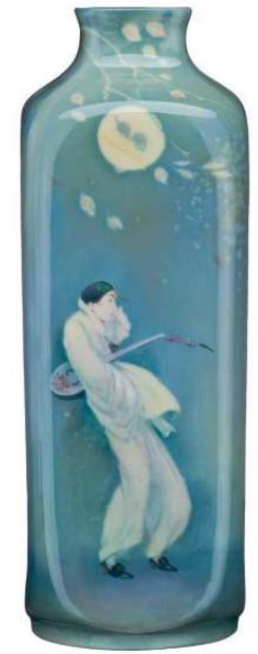
TV4 (height 27cm).