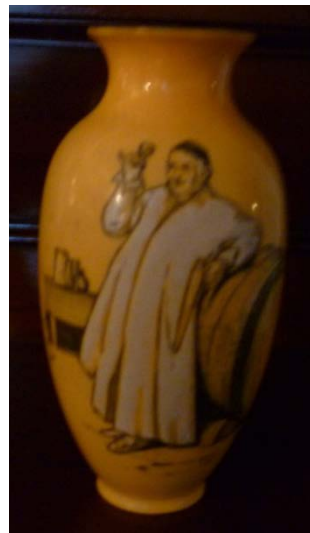
V30. Monk drinking (height 200mm).